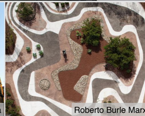
Roberto Burle Marx