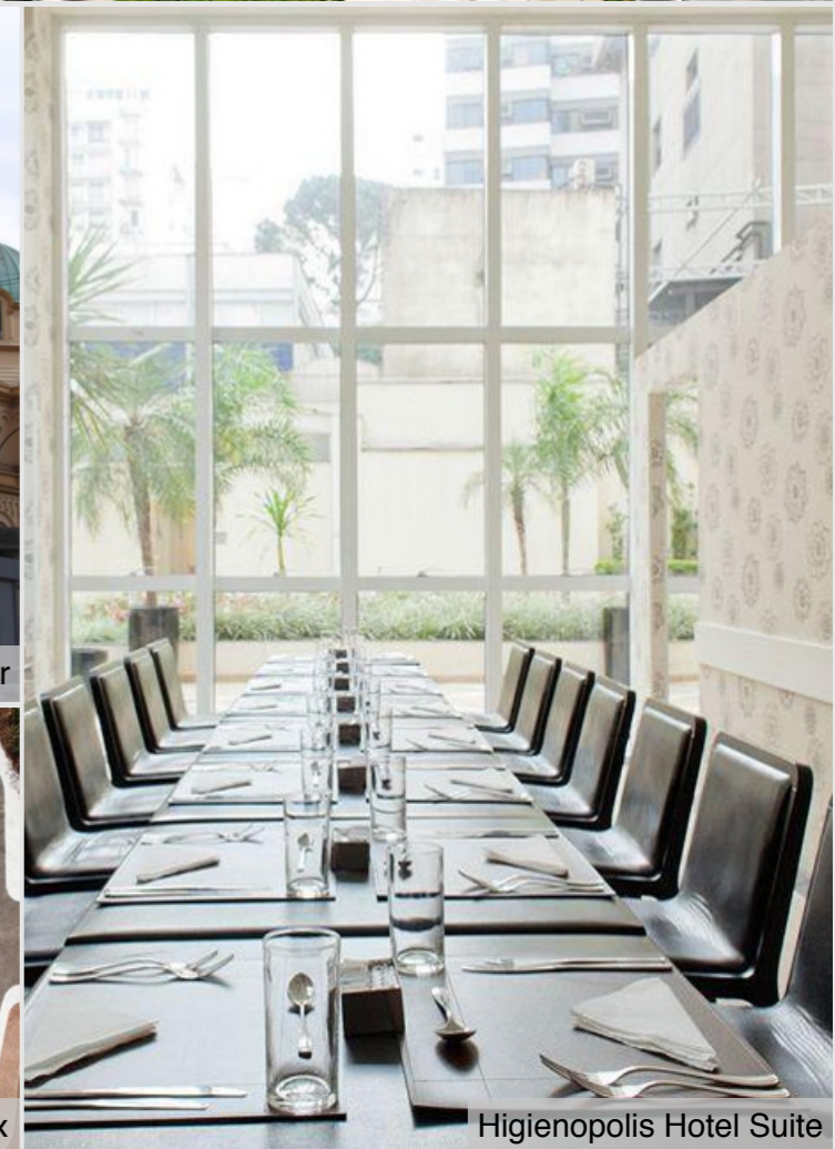
Higienopolis Hotel Suite